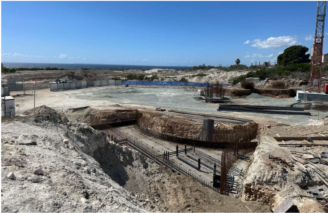
Figure 7 Construction site works - Swimming pool mechanical plant room (front)