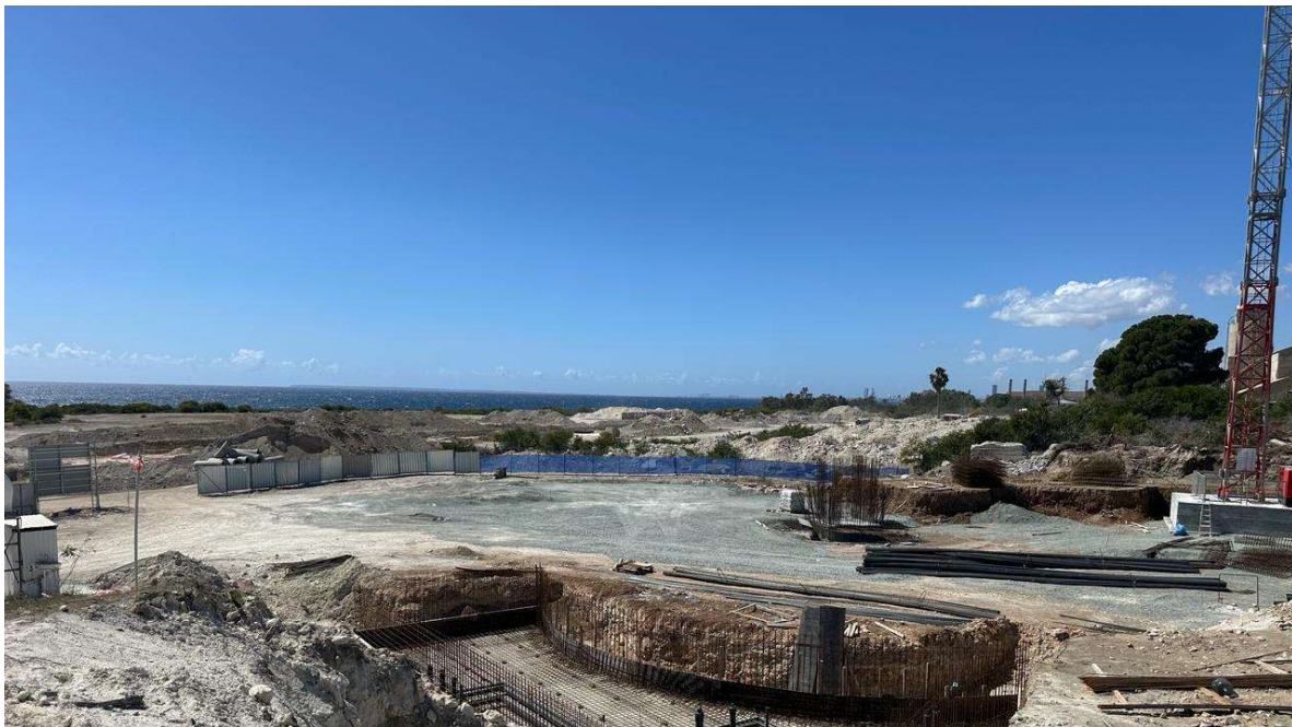
Figure 5 Construction site works - Block 6 (back)

Concrete Works – Lift pit formwork is completed, steel reinforcement has been placed and foundation has been cast.