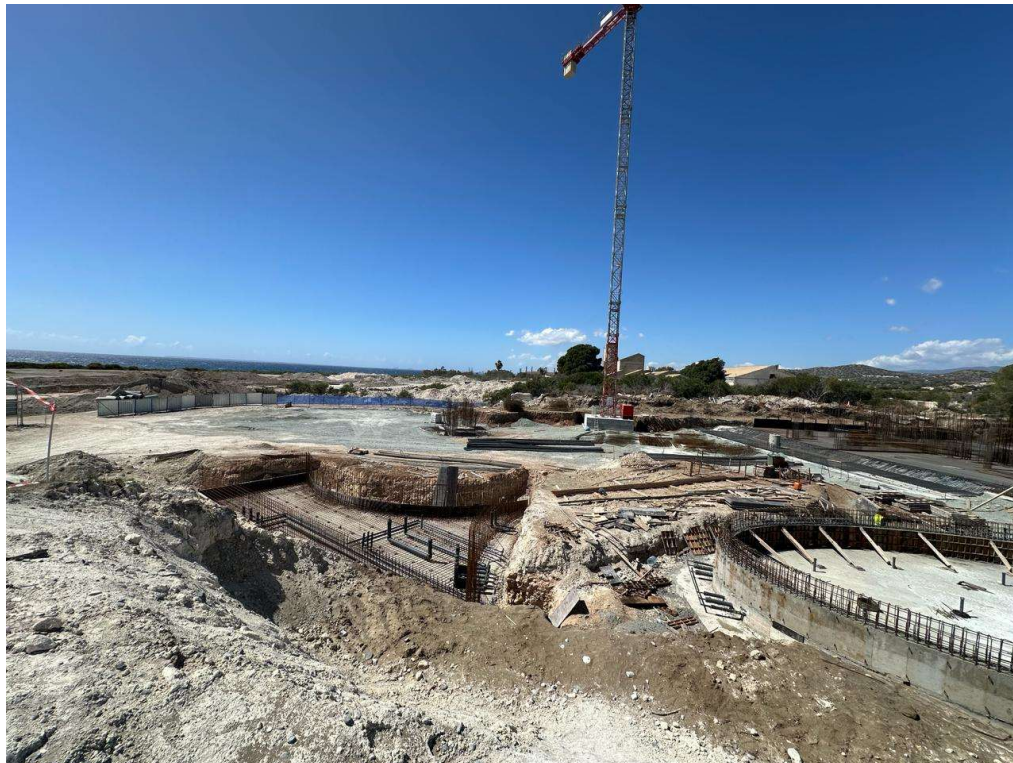
Figure 10 Construction site works – Swimming pool (front right), pool mechanical plant room (front left), Block 7 (back right), Block 6 (back left).