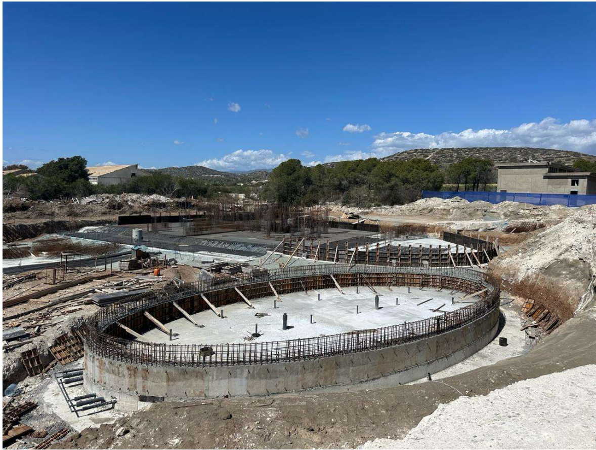
Figure 9 Construction site works – Swimming pool (front)