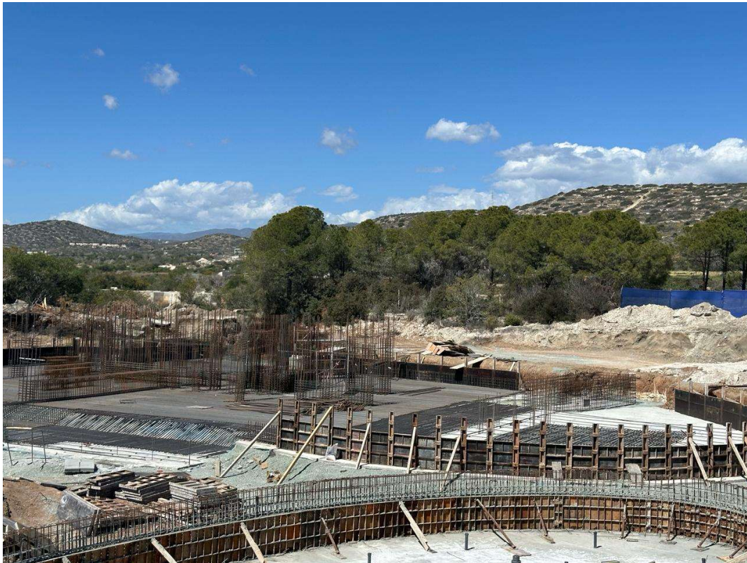
Figure 6 Construction site works - Block 7 (back)

Concrete Works – Grobeton (lean concrete) below foundations is laid. Formwork and steel reinforcement for foundations has been completed. Foundations casting will commence in 2 weeks.