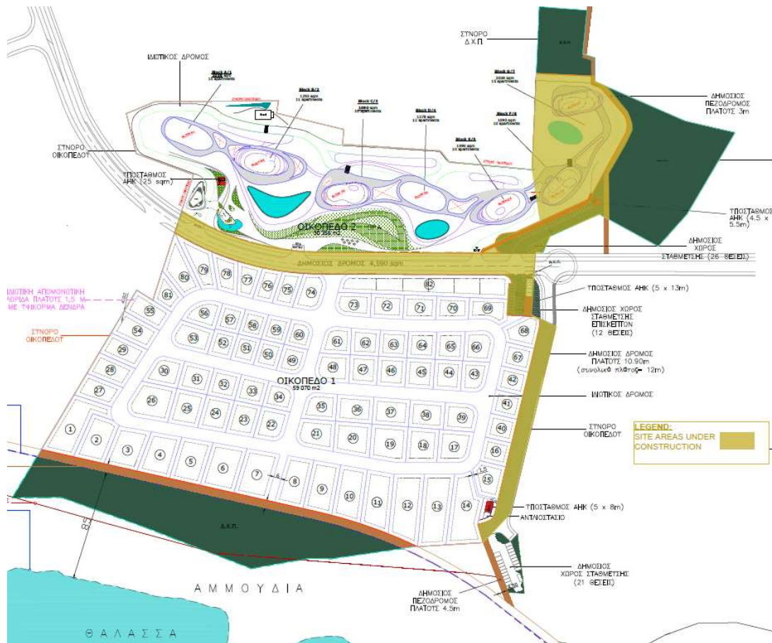
Figure 1 Masterplan - Site areas currently under construction.

Construction commenced in January 2024 and the estimated completion date is November 2025.