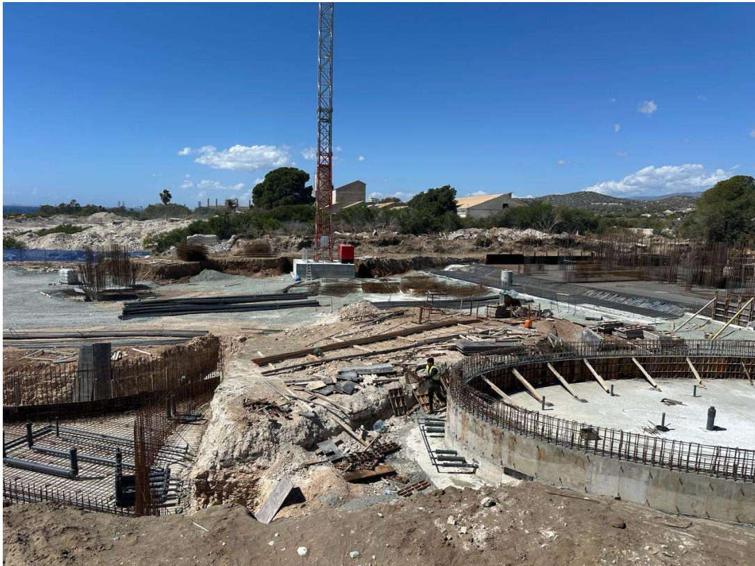
Figure 8 Construction site works – Swimming pool (front left) & its mechanical plant room (front right)