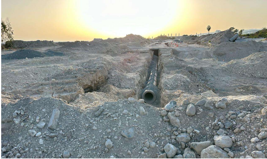
Figure 4 Construction site works – Road underground ducting.

Ground works have been started including installation of underground utility ducting.